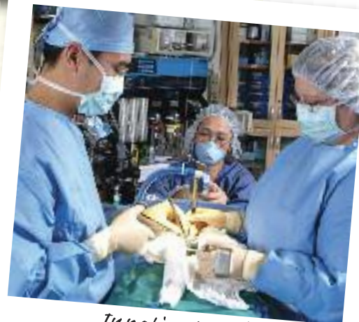
Inpatient and Outpatient Surgeries