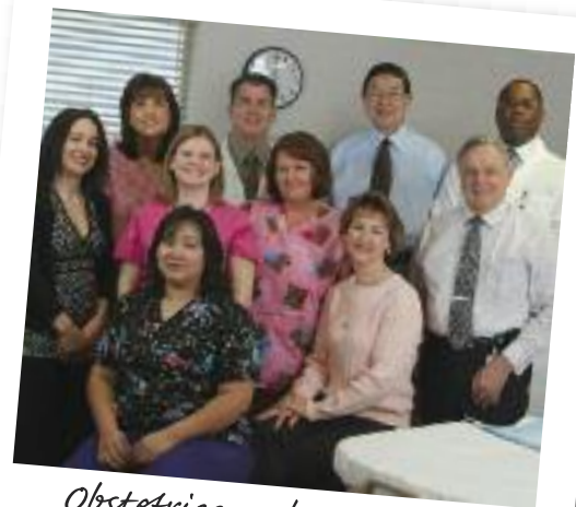
Obstetrics and Gynecology Department